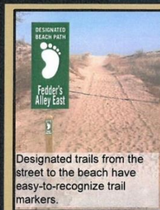
Designated trails from the street to the beach have easy-to-recognize trail markers.

Walking off of designated trails to go to the beach results in immediate and long-lasting damage to the dunes.