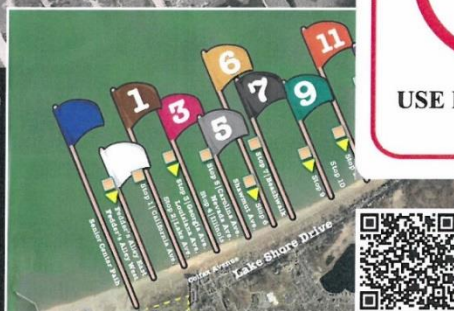
Left: A map of designated trails managed for easy beach access in Michigan City. Scan the QR code to learn more.